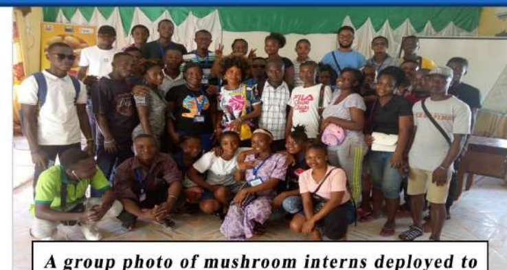
A group photo of mushroom interns deployed to Pujehun

A s part of the internship skills development exercise in the Mushroom Value Chain skills training, the Horticulture Department of the School of Natural Resources Management, Njala University, has deployed two hundred and eighty trainees to all the district headquarter towns in the country.