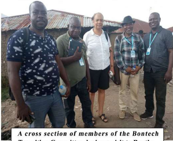
A cross section of members of the Bontech Transition Committee during a visit to Bonthe

A s provided for in the 2005 Universities Act, Njala University has officially instituted the Bonthe Technical Institute Transition Committee, which will see Bonthe Technical Institute become a campus of the University.